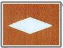
Mother of Pearl Diamonds