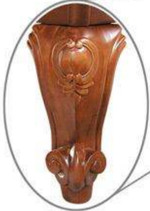
Hand Carved Legs