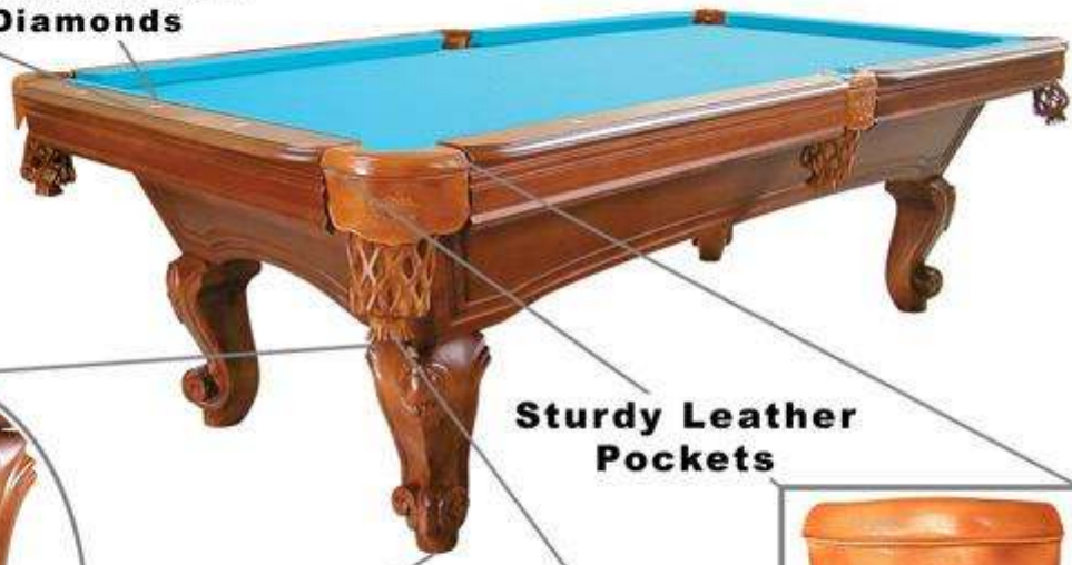
Sturdy Leather Pockets